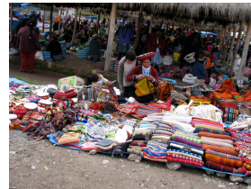
Visit the Andean weaving markets - traditions continue!