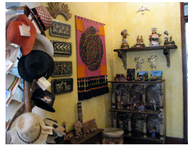
Shop for classic Andean crafts in Quito