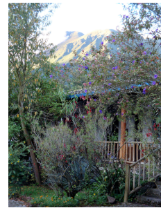
Hacienda Cusin; a 1602 restored hotel on 30 acres! Excellent!