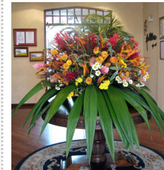
Flower capital of the world!

Find your passport! Count up those frequent flyer miles! Pack a suitcase & you're ready to go!